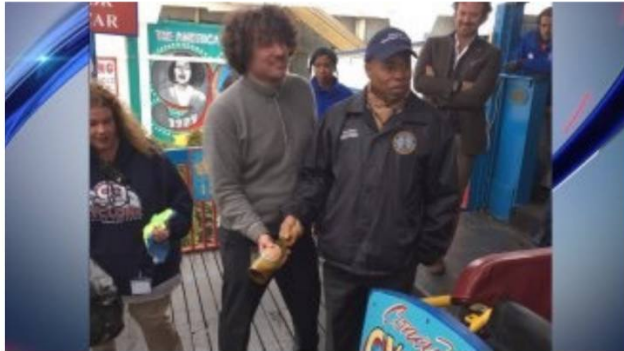
Brooklyn Borough President Eric Adams christened the Cyclone roller coaster