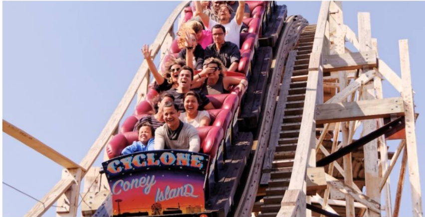
Luna Park will offer free admission to guests on it's 2018 season Opening Day.