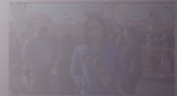
Coney Island's Luna Park opened for the season Saturday, just days after the winter snowstorms.

Organizers say the turnout was about twice that what they expected thanks to the day's clear skies and moderate temperatures.